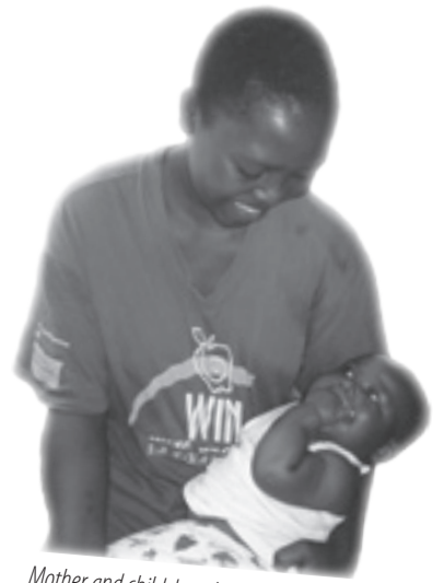
Mother and child, Lugulu Friends Hospital, Kenya

Often the problems of this world are so overwhelming that we feel too insignificant to think we can make a difference. Countless faith groups encourage us to join them, but sometimes we hesitate because we want something or someone we are connected to, identify with, and trust. Just as the number of television channels has increased exponentially, so have the number of ministry channels vying for our attention. Thankfully, over 100 years ago a channel was set up to energize and equip Friends who have a heart for schools, medical missions, training pastors, curriculum development, and more! Friends United Meeting is that channel.