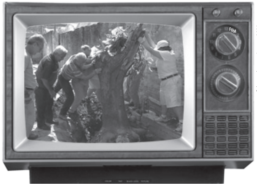
Cuba work team, January 2009