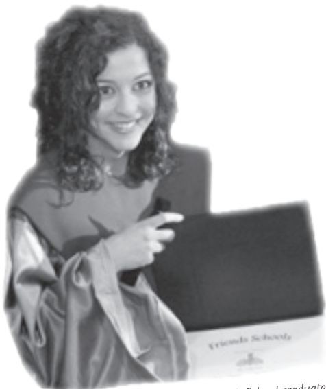
Ramallah Friends School graduate

From Presidential debates to the fall of the Berlin Wall, Princess Diana's wedding to Neil Armstrong's first steps on the moon, television has revealed to us a common history and taken us places we could never go on our own. But even before television began connecting people to the wider world, FUM was fostering those connections. FUM has been your channel since 1902. As you select television channels that provide wholesome entertainment and worthy news coverage, know that FUM is your channel for ministry!