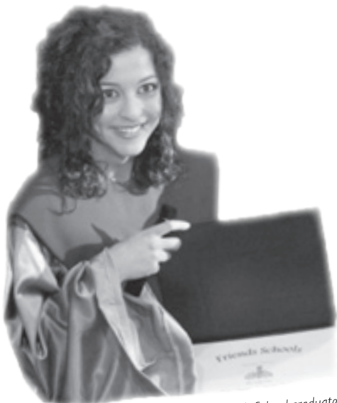
Ramallah Friends School graduate

From Presidential debates to the fall of the Berlin Wall, Princess Diana's wedding to Neil Armstrong's first steps on the moon, television has revealed to us a common history and taken us places we could never go on our own. But even before television began connecting people to the wider world, FUM was fostering those connections. FUM has been your channel since 1902. As you select television channels that provide wholesome entertainment and worthy news coverage, know that FUM is your channel for ministry!